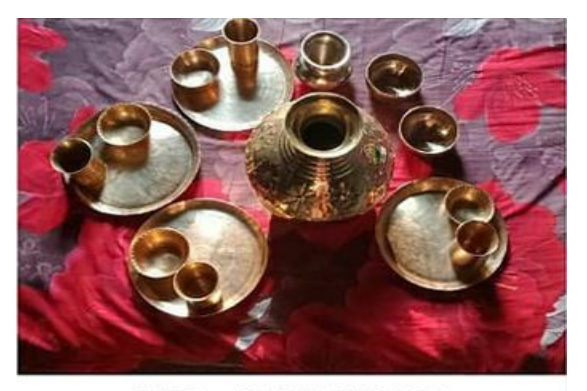
2ND - ANIKET TOPPO