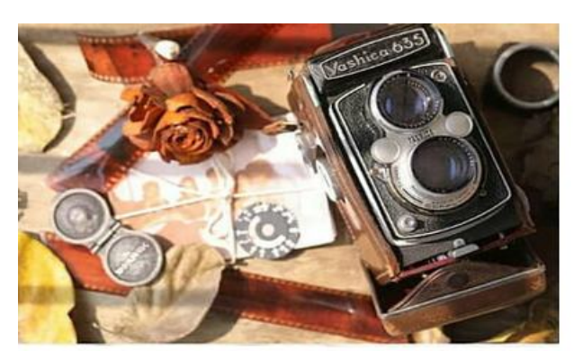
1ST - YUKTI RANJAN