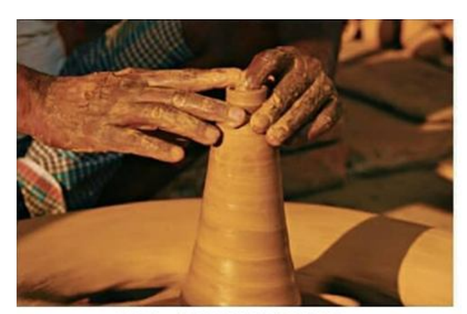
1ST - ADITI KACHHAP