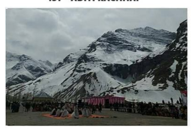
3RD - MANSI MITTAL