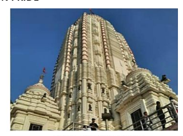
2ND - DIGYA SINGH