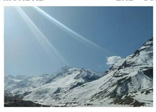
3RD - MANSI MITTAL